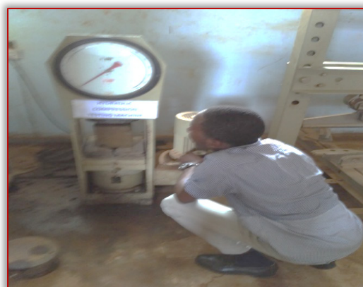
Figure 3. The compression testing machine

The top surface was leveled and smoothed with a trowel. The specimens were marked for identification and stored in moist air for 24 hours and later removed from the moulds. Compressive strength test was performed after curing the samples for 7 days, 14 days and 28 days using compression testing machine (Figure 3).