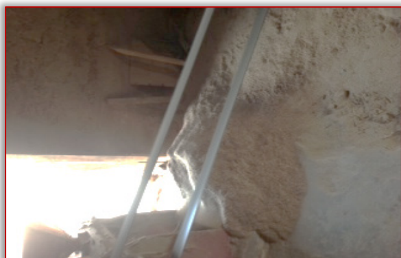
Figure 1. Showing rice husk being milled to produce GRH Rice husk is burnt approximately 48 hours under controlled combustion process inside ferrous-cement furnace to produce rice husk ash (RHA). The burning temperature was within the range of 600°C to 850°C (Figure 2). The ash obtained is ground in a ball mill for 30 minutes and its color was seen as grey

The rice husk used in this work was collected from rice paddy industry in Ikole Ekiti, Ekiti State, Nigeria. Grinded rice husk (GRH) was obtained by milling rice husk inside milling machine (Figure 1).