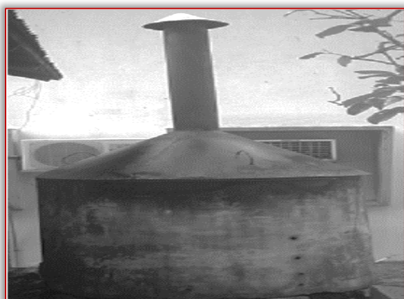
Figure 2. Showing RHA being produce inside ferrous-cement furnace

Figure 1. Showing rice husk being milled to produce GRH Rice husk is burnt approximately 48 hours under controlled combustion process inside ferrous-cement furnace to produce rice husk ash (RHA). The burning temperature was within the range of 600°C to 850°C (Figure 2). The ash obtained is ground in a ball mill for 30 minutes and its color was seen as grey