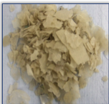
Figure 3. Recycled polyvinyl butyral [8]

Polyvinyl butyral, which forms a safety interlayer in windscreens or building glasses, by material recovery takes the form of flakes having a size of 2-20 mm and a thickness of 0.5 mm to 1.5 mm (see Figure 3).