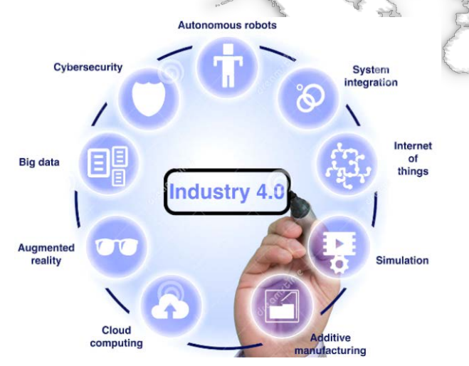
Figure 2. The main technologies of Industry 4.0 [6]

The connected new technologies are shown in Fig. 2