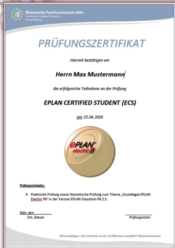
Figure 4. ECS certificate issued by RFH

As stated in [5, p.3081] "in consideration of the continuously growing number of the applicants of the CAD/CAE software EPLAN Electric P8 in the industry and educational market, RFH in collaboration with the EPLAN Company has created new international certification models for scholars and students called EPLAN Certified Student (ECS) and EPLAN Certified Technician (ECT). ECS is certification which considers universities and universities of applied sciences, and ECT certification considers vocational schools, master