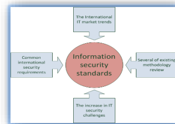
Figure 1. The main factors of the information security standards (by the authors)

standardization began when the languages and number systems, ensuring consistent communication within groups. The development of a system of units of measurement was a conscious tool of standardization, trade, manufacture, levy made this necessary.