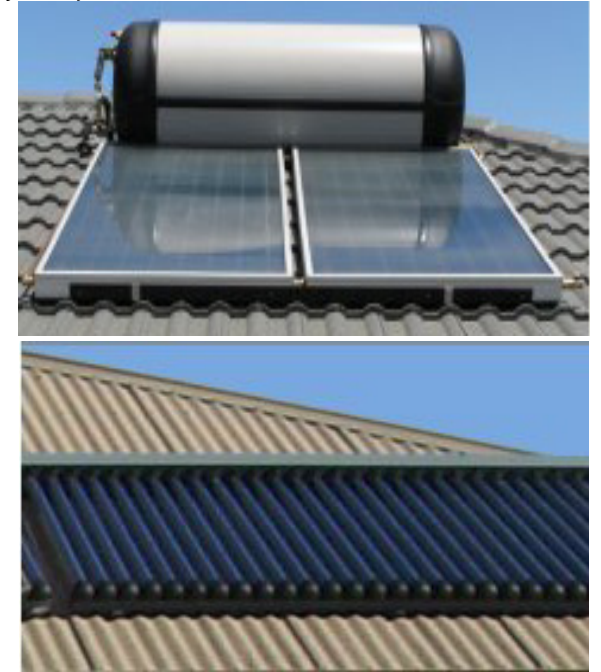
Figure 1. Flat panel (left) and evacuated tube collectors i. Flat plate solar collectors

evacuated tubes (more efficient and great for frost prone areas)