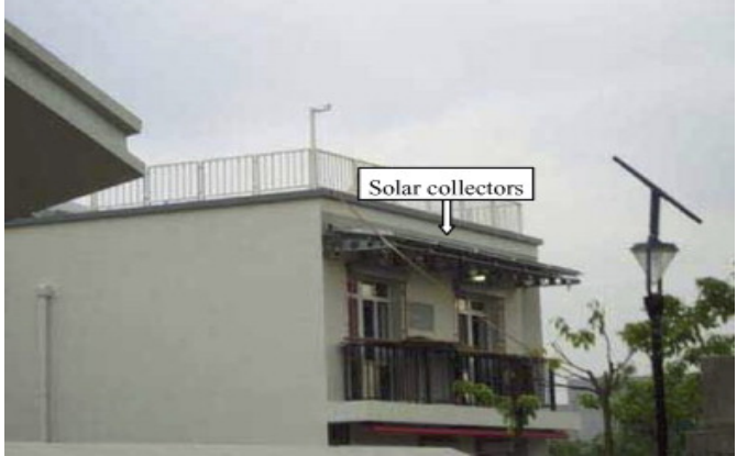
Figure 3. Solar hot-water system in villa iii. Integration of solar collectors and green office building

In the villa, because the whole roof is occupied by technologies of solar photovoltaic then U-type evacuated tubular solar collected is customized with CPC in terms of the dimension of awning, as shown in below. Such design provides another example of how a solar element could be used in the original design in a logical manner, especially for those without enough roof area. The solar hotwater system in the villa is similar with those of flat (Figure 3).