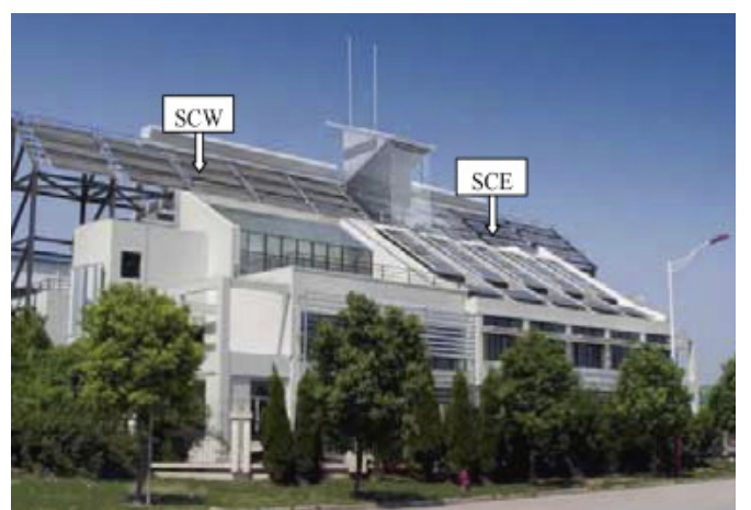
Figure 4. Appearance of the green office building integrated with solar collectors

As the power to drive adsorption chillers and the heat source for the floor heating and natural ventilation, the solar collectors are the most important parts. We installed solar collectors on the roof of the green building, wherein U-type evacuated tubular solar collectors with CPC of area were placed on the west side (SCW), and the other heat pipe evacuated tubular solar collectors on the east side (SCE). For the purpose of efficient utilization of solar energy, the architects designed a steel structure roof, facing due south and tilted at an angle of 40° to the ground surface, on which the solar collectors were mounted and integrated with the building perfectly [6].