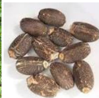
Figure 1. a) Jatropha b) Jatropha Seeds