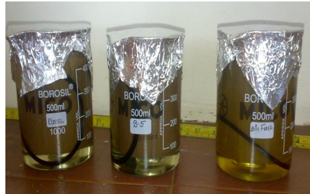
Figure 3. Fuel injection components in the biodiesel

A few automobile manufacturers extended their warranty only to lower blends of biodiesel (e.g. B5). But the higher blends (e.g. B50 or B100) are still not covered by warranty. In India's biofuels policy, Jatropha biodiesel is considered as an alternative substitute for the diesel. But many researches on Jatropha biodiesel have concerned the engine gas emissions and engine performances and not any significant work has been carried out to study the effect of Jatropha biodiesel on the engine fuel injection components such as fuel filter, gasket and fuel tubing. Hence, this work has been carried out to study the effect of Jatropha biodiesel on the engine components by static immersion study and also to study the variation in the fuel property during long storage period. In static immersion study, the engine fuel filter, gasket and fuel rubber tubing were immersed in the fuel samples kept in the 500 ml beakers. The beaker top end was closed with the aluminum foil and the arrangements were shown in the Figure 3. The static immersion study was carried out for the 12 month.