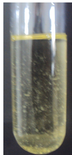
Figure 5. Deposition on the holder of the fuel filter