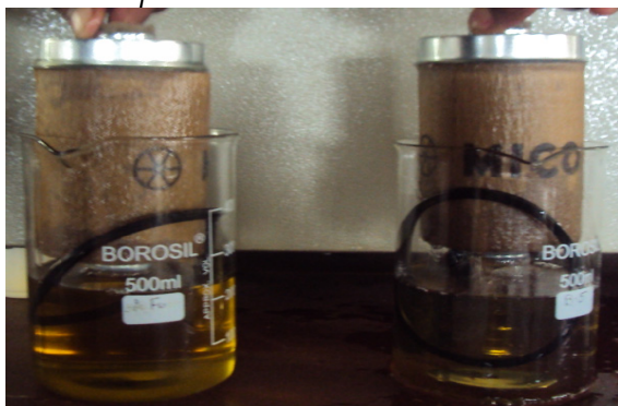
Figure 4. Fuel filters which were kept in the B100 and B5

The engine fuel injection components such as fuel filter, gasket and fuel lining tube were taken out from the beakers containing biodiesel (B100), B5 and diesel. These components were observed for the corrosion and sediment deposition. The size of the fuel filter was enlarged during the storage period as compared to the B5 and diesel. Figure 4 compares the fuel filter which was kept in the B5 and B100 samples. A thin layer of deposition was observed at the metal holder of the fuel filter which was kept in the Jatropha Biodiesel (B100) sample. The deposition in the fuel filter holder was removed and is shown in the Figure 5. Figure 6 shows the microscopic image of this deposition. This is due to the autooxidation, hygroscopic nature, polarity, higher unsaturated components and solvency properties of the Jatropha biodiesel. It also causes degradation elastomers. The metal holder exposed to B5 and diesel does not have any deposition. Hence, B5 use will not affect the fuel components which are used in the diesel engine components. If Jatropha Biodiesel (B100) is used as fuel in the diesel engine, then it will affect the fuel injection components which may leads to clogging of the injection pumps and filters, poor engine performance and early replacement of few fuel injection components.