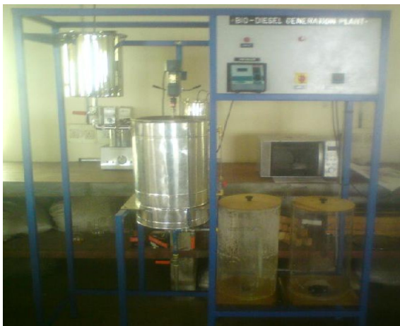
Figure 2. Biodiesel plant

After the confirmation of phase separation, the products of transesterification were heated above 70°C, to remove the excess methanol and then products were transferred to the settling tank. Then the products were allowed to settle for 8 hour and two layers were observed. The top layer containing biodiesel was removed and the washed with warm distilled water to remove the soap, catalyst etc. Figure 2 shows the biodiesel plant. The biodiesel properties were determined as per ASTM standards