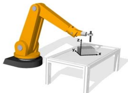
Figure 5. Workpiece coordinates