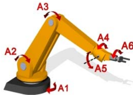
Figure 3. Joint coordinates