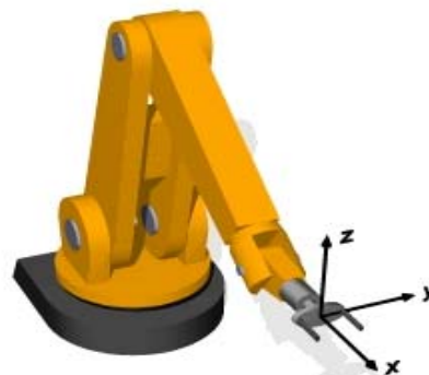
Figure 4. Gripper coordinates